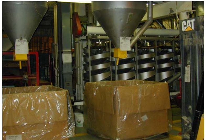
Seed conditioning area with clean seed bins

Other related Brassica crops grown for seed include arugula, broccoli-raab, Chinese cabbage, Chinese kale, Chinese mustard, kale, mustard, pak choi, radish, and turnip. Many of these crops are grown as annuals and are direct-seeded rather than transplanted. Brassica oleracea seed crops are very susceptible to certain insects and diseases, requiring extensive control for successful seed production (1). Weeds are primarily problematic during the early growth phase of the crop.