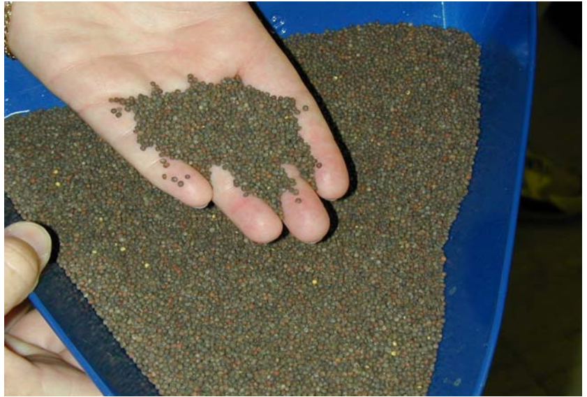
Dried cabbage seed

Small-seeded vegetable seed production takes place on approximately 4,500 acres in western Washington annually, contracted by approximately 7 seed companies. The average field size for cabbage seed crops is 5 acres for hybrid seed production and 15 acres for open-pollinated seed production. Rotation periods for cabbage are a minimum of 5 years to mitigate disease problems. Companies control the location of seed crop fields in order to prevent cross-pollination among cultivars of the same crops (within and among cabbage open-pollinated seed and hybrid seed) and of cross-compatible crops (e.g. related crucifer species). Isolation distances vary depending on whether the crops are grown for market or stock seed, and can range from one-quarter mile to 2 miles or more.