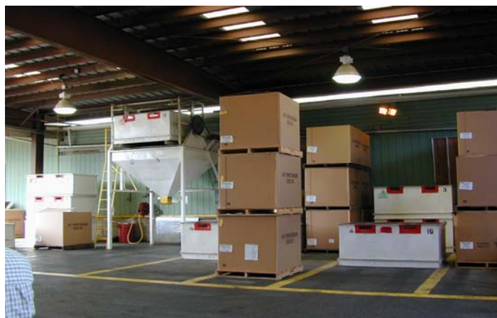
Temporary seed storage area

Chlorpyrifos (Lorsban 4E at 0.05-0.086 lbs AI/1000 linear ft. row, Lorsban 15G at 0.04-0.09 lbs AI/1000 linear ft. row). 30-day PHI. Chlorpyrifos is applied as a drench following transplanting, on 100% (500 acres) of the area planted for cabbage seed (1).